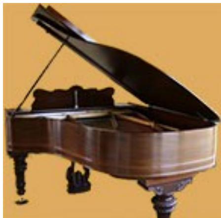
Pacem Music Studio