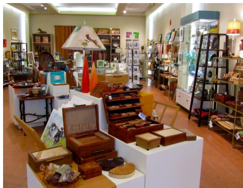
Artisan’s Way Gallery