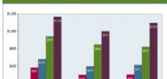
Women's median weekly earnings by race/ethnicity and education, 2012

Note: See next page for the schedule/flyer.