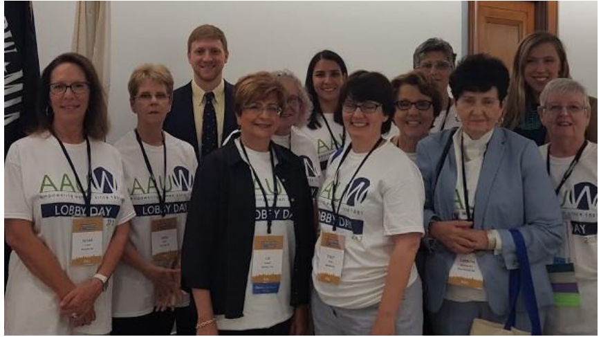
Some of the Massachusetts delegation with Senator Markey's aides.

We heard from Judy Woodruff, PBS news reporter, about speaking truth to power. She was a great speaker as you can imagine and very down to earth. Two CEO's and founders of polling companies, one Republican and one Democrat, addressed the audience on where they failed in the 2016 election and where we can do better and how to use their data for our purposes. They were friends as well as rivals and they made their conversation funny and relevant. The Republican was not in the least a Trump fan and she let everyone know it without even speaking his name.