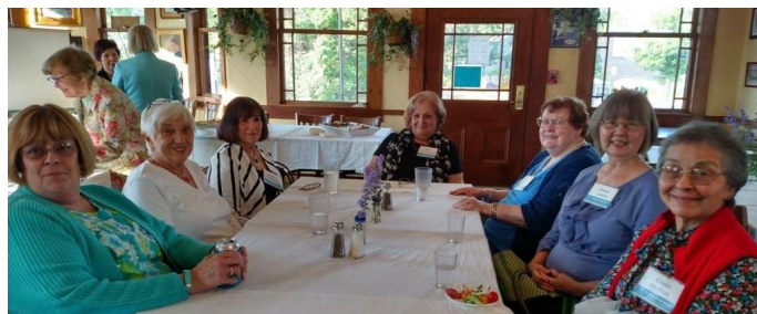
Some of the group