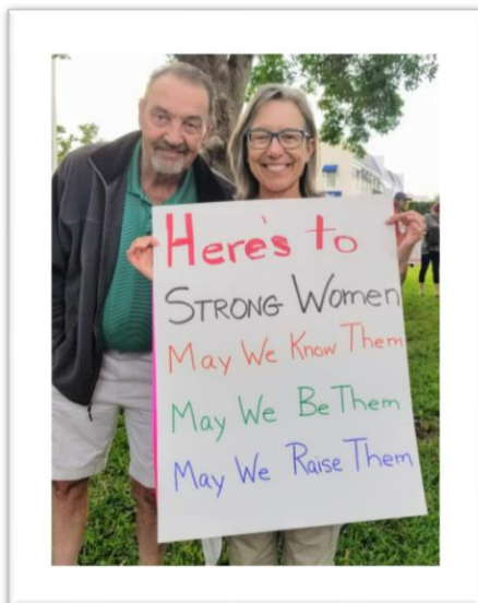
Yes! Yes! Yes!