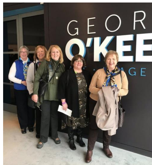
Culture Group at PEM

This month I'd like to highlight some of the branch membership benefits that I have appreciated throughout the nine years that I have been a member. In our South Shore Area branch we have four Special Interest groups: Adventures in Dining, Book Discussion Group, Culture Group and Girls' Game Night. I participate in the Book Group, Game Night, and the Culture Group. The Book Group and Game Night each meet one night a month at a member's home. The Book Group has a monthly book selection and a pre-determined date (location TBA) in our Directory