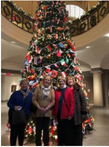
Visit to the MFA

Please look for emails from me for upcoming plans. All members are welcome to attend our outings. Recent visits included a trip to MFA Monet Exhibit.