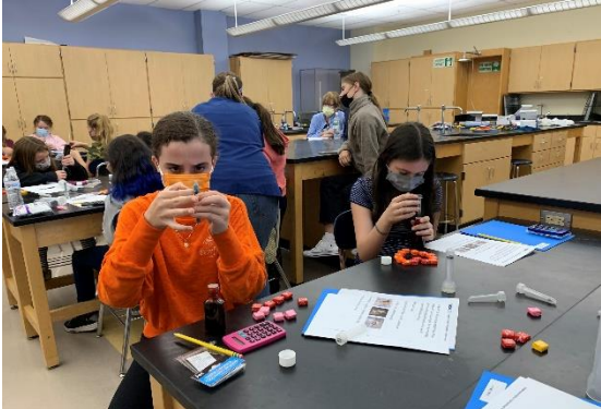
Pet First Aid

Presented by AAUW South Shore Area Branch and Weymouth Public Schools