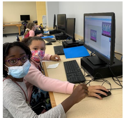
Coding in Action