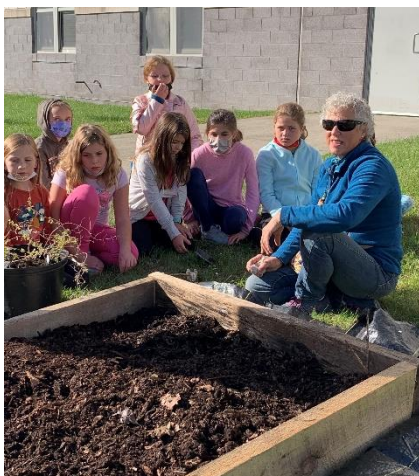
Agriculture is Awesome