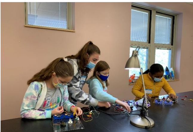
So You Want to be an Engineer