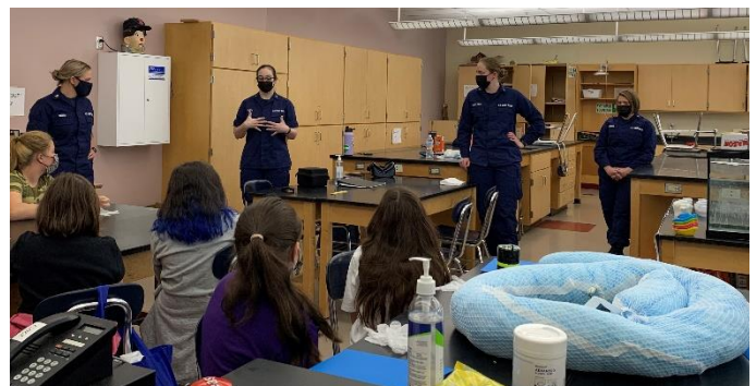
Coast Guard-Always Ready!