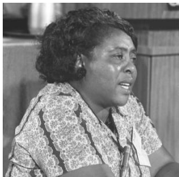
Fannie Lou Hamer